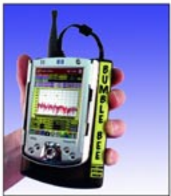
Figure 4. Berkeley Varitronics Systems BumbleBee™ Multi-Band Spectrum Analyzer